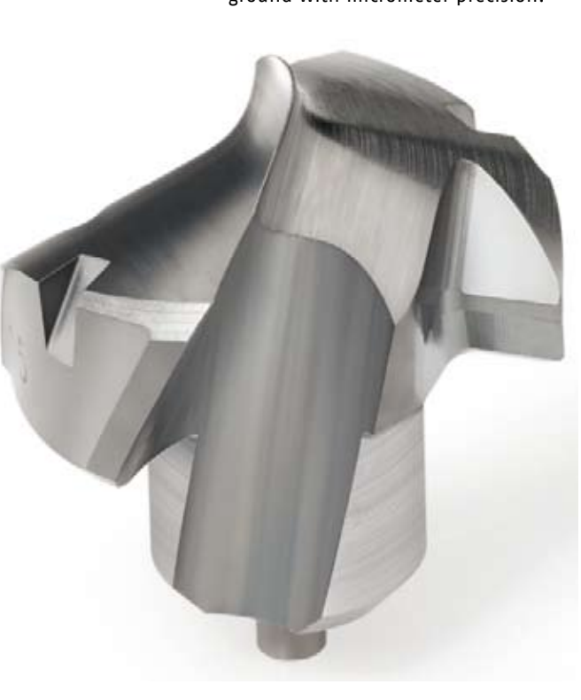
Figure 2 KenTip<sup>TM</sup> drilling head

In many cases today, tool systems are offered which consist of replaceable carbide tips and a holder. With this inexpensive system, the carbide inserts are either screwed in or clamped. In order that after assembly, the tool system is at least as precise as a solid carbide tool, the holders and carbide tips have to be manufactured with higher precision than a solid carbide tool. Furthermore, the surfaces provided for the clamping have to be ground with micrometer precision.