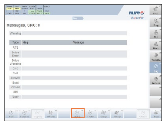
Press F6 (NCCfg) to enter the CNC configuration menu