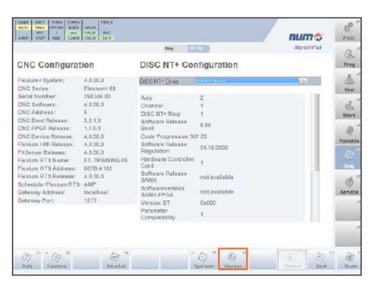
Press F8 (Devices) to enter the device list