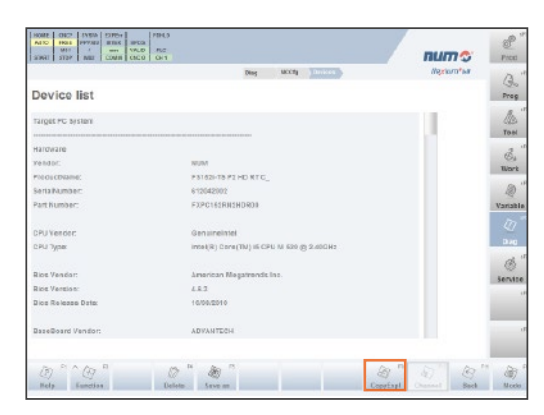
Press F9 (Copy Expl.) to open the Copy Explorer