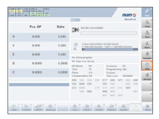
Press sF6 (Diag) to enter the diagnostic menu