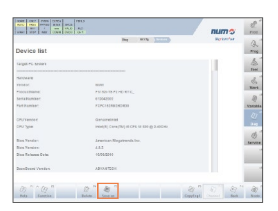
Press F5 (Save as) to save the device list