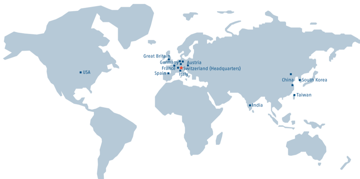
Some training facilities

All NUM technical centers are equipped to provide training. These sessions will either take place in our premises or in your facility.